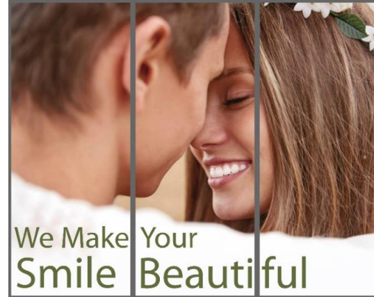
Graphic visible zone: 94 cm x 234 cm